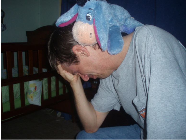
Photo from that night. I was crying from joy, and incredulity. This was about 3 am, after about 7 hours of activity.